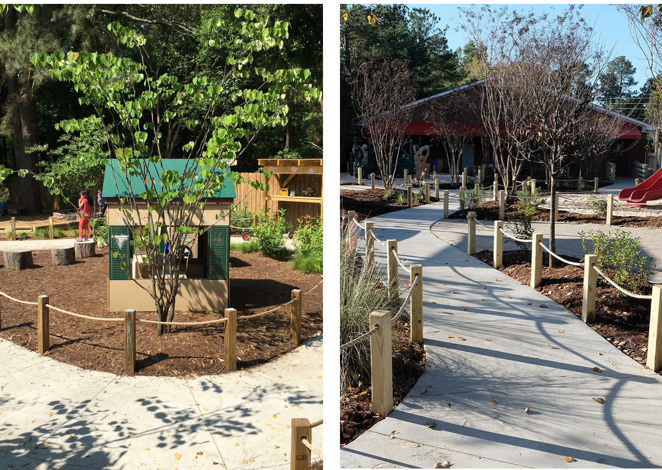
AESTHETIC - POST & ROPE BORDERS / PLANT PROTECTION