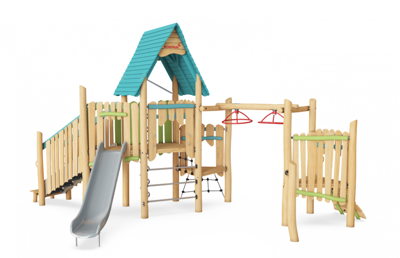
KOMPAN - DOUBLE TOWER / TURBO CHALLENGE