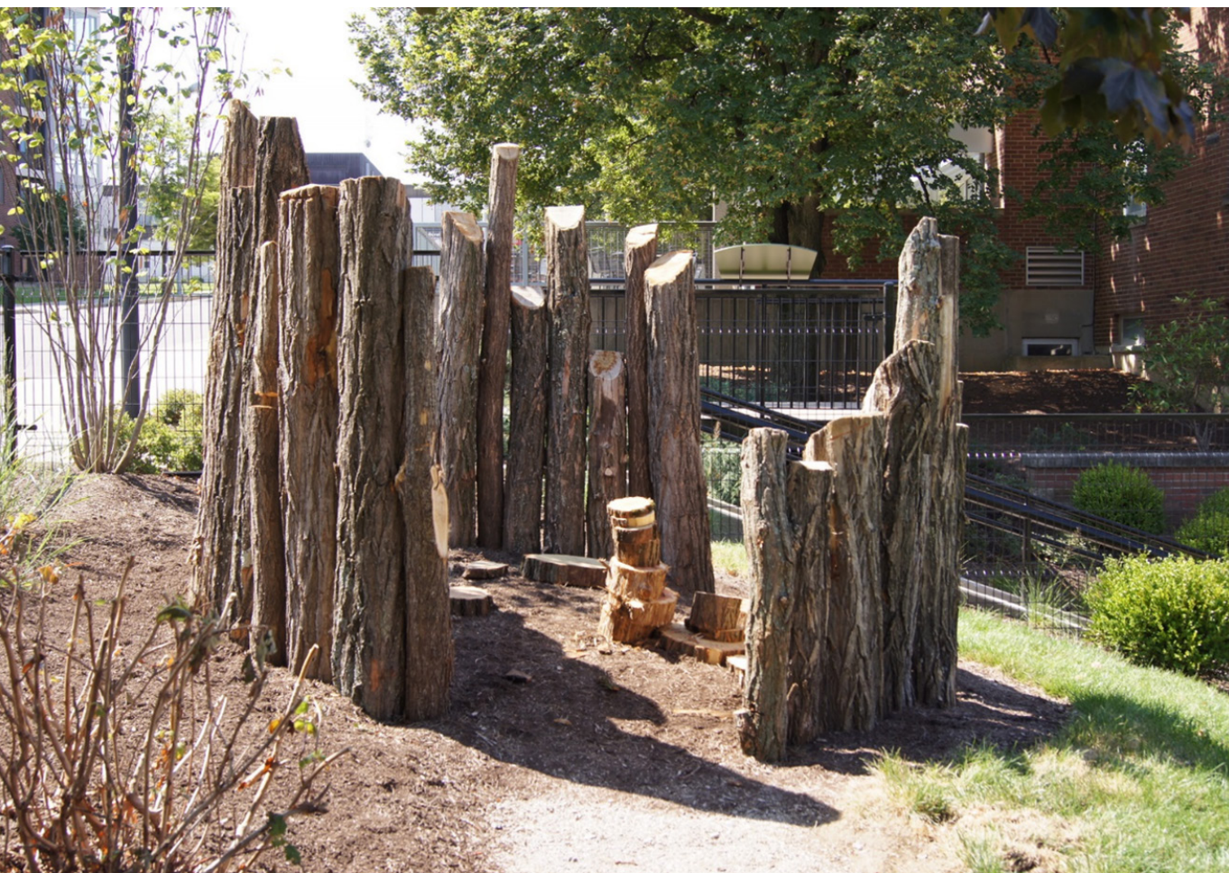
UPRIGHT LOG CIRCLE (COULD GO IN ONE OF THE NOOKS?)