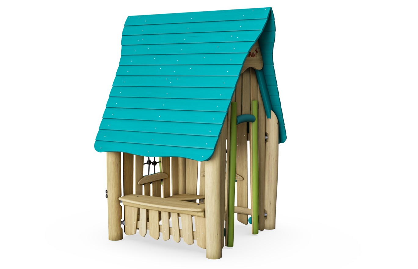
KOMPAN - VILLAGE SHOP