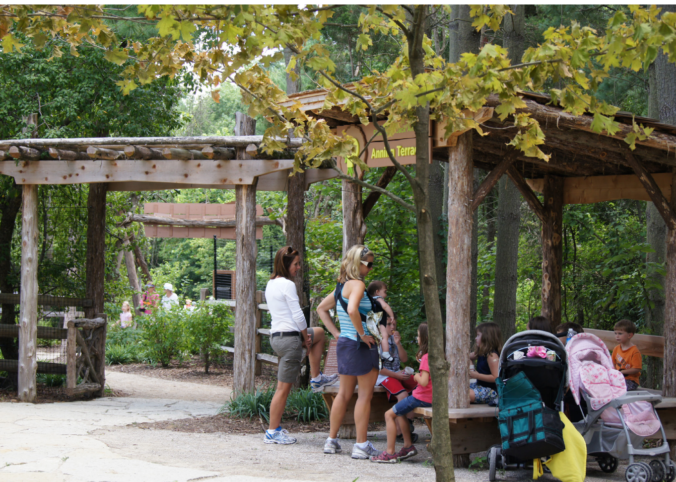
SHADED GATHERING SPACE & ENTRY TRANSITION