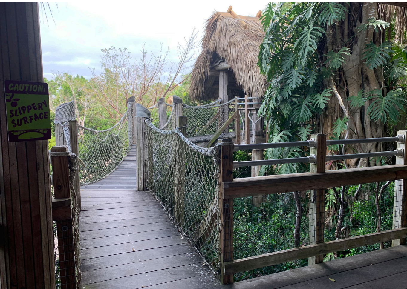
AESTHETIC - THATCH / NETTING / BOARDWALK / VEGETATION