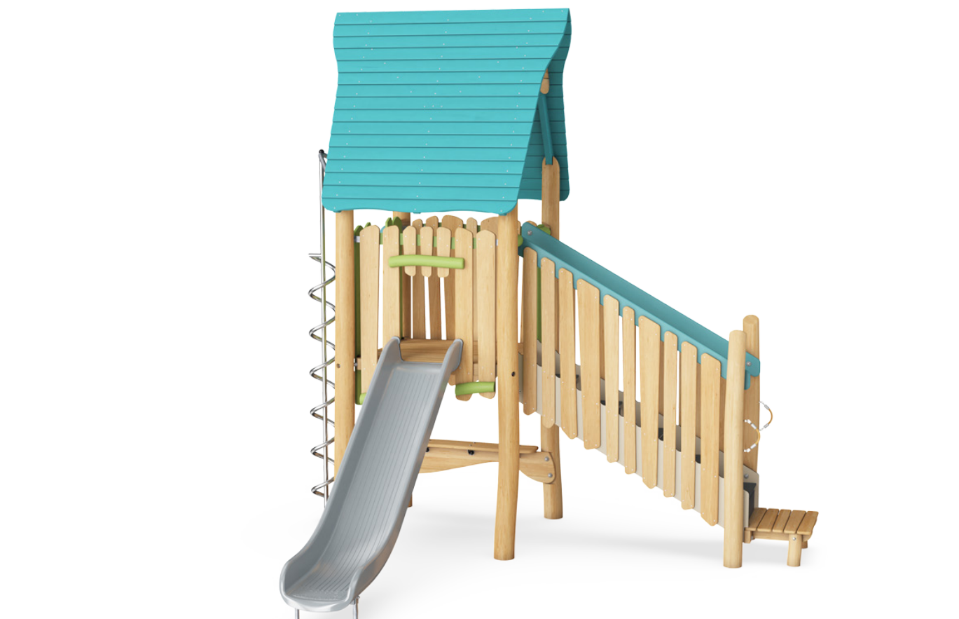
KOMPAN - PLAY TOWER WITH SLIDE & DESK