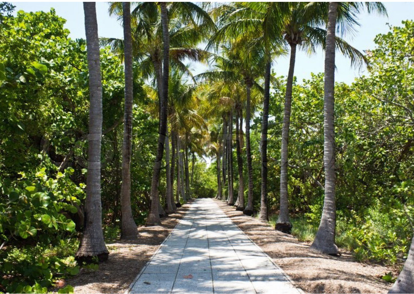
PALM TREE PROMENADE