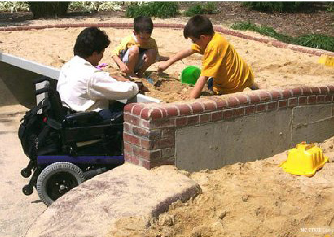
ACCESSIBLE SAND TABLE (TO BE BUILT INTO SEATWALL)