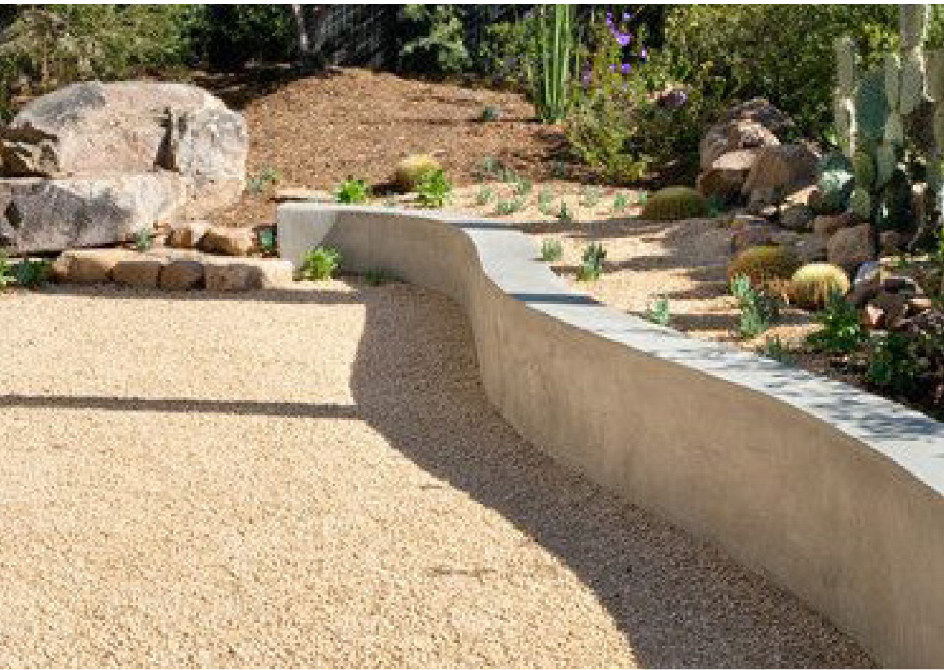
CONCRETE SEATWALL (TO RETAIN SAND AND VEGETATION)