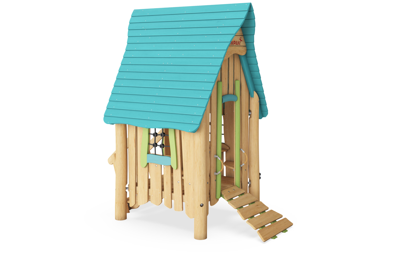
KOMPAN - VILLAGE HOUSE