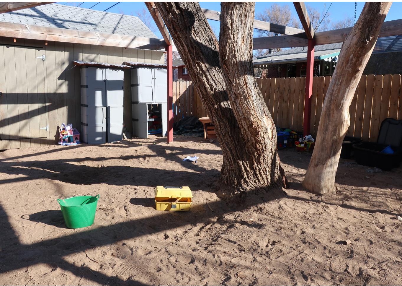
VERTICAL LOG CENTER (IN SAND AREA; CAN SUPPORT SHADE SAIL)